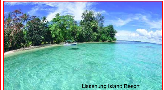
Lissenung Island Resort

For high season departures ex. Cairns please add $115 // ex. Brisbane please add $80 during low season and $ 195 during high season // ex. Sydney please add $160 during low season and $ 275 during high season to above package prices.